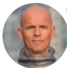
HERBERT NISCH “The Deepest Man on Earth” with a No Limit freedive to 253m/831ft, Nisch has set 33 world records in all of the freediving disciplines.

Inside the minds of two diving champions